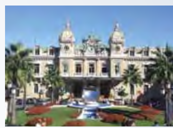
Monaco & Monte Carlo