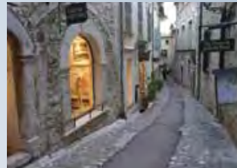
St. Paul de Vence