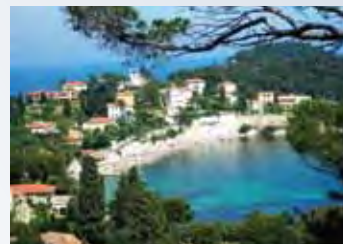
St. Jean Cap-Ferrat