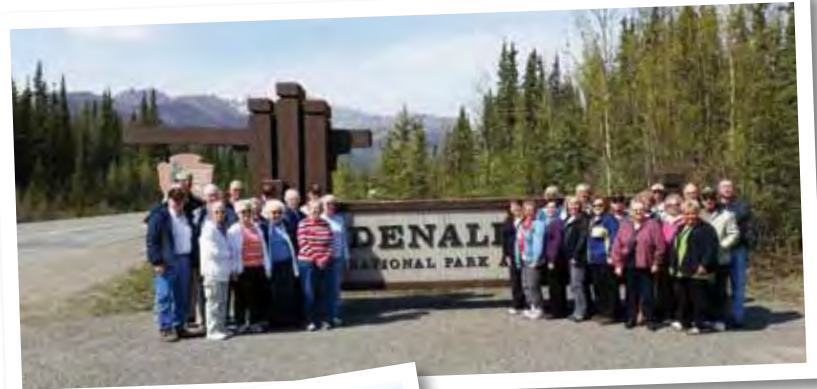
The group pauses for a photo at the entrance to Denali National Park.