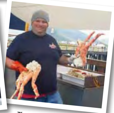
That's what's in the pot!