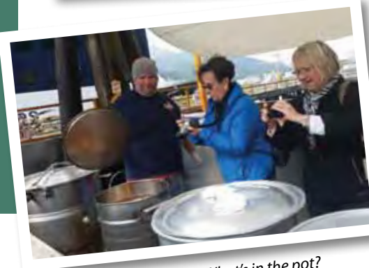
What's in the pot?